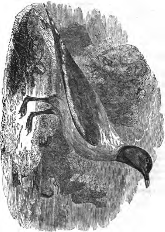
Sabine's Gull.—p. 297.